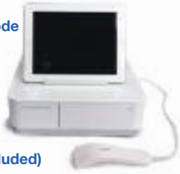
(Tablet Not Included)