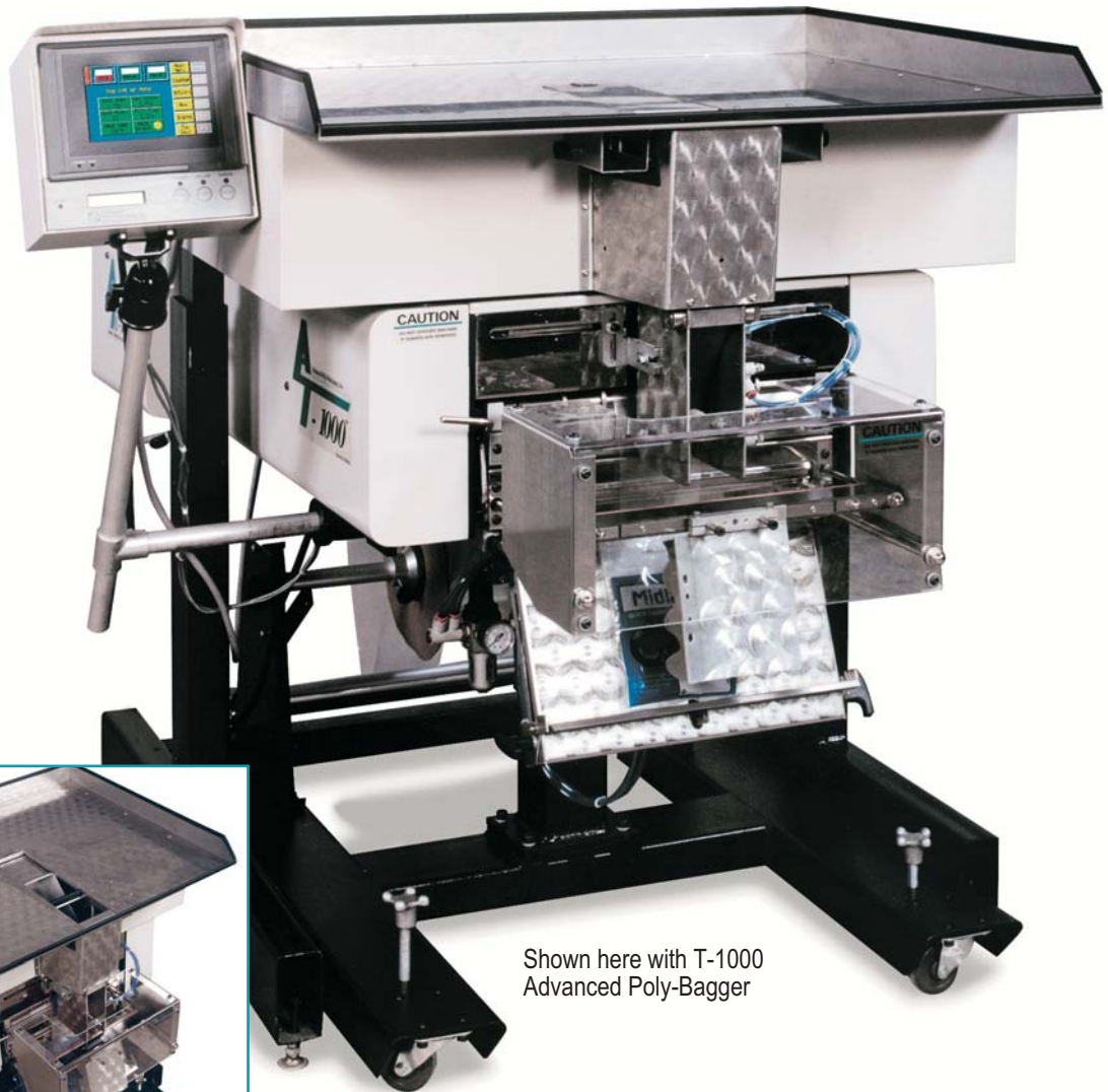
Shown here with T-1000 Advanced Poly-Bagger

When fast changeover is more important than automation, our US-5000 Scale is the solution. The US-5000 sets up in seconds, unlike automatic scales that typically require longer setups and are designed for longer runs. Just slide any "sample" quantity in the load tray, key in your quantity, press the count button and you're finished!