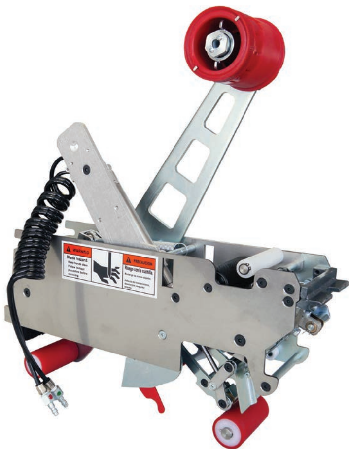
CAC60 Pneumatic cartridge shown

Built To Last: For over 50 years, Loveshaw has built quality engineered products for the packaging industry. Our Little David® CaseLocker™ line of tape cartridges are a result of challenging the notion that "today's design is the best solution." We consistently strive to engineer new products for tomorrow's packaging needs.