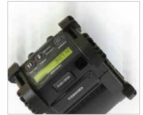
Robust and rugged, withstands a 1.8m drop on to concrete (1.5m for B-EP4)