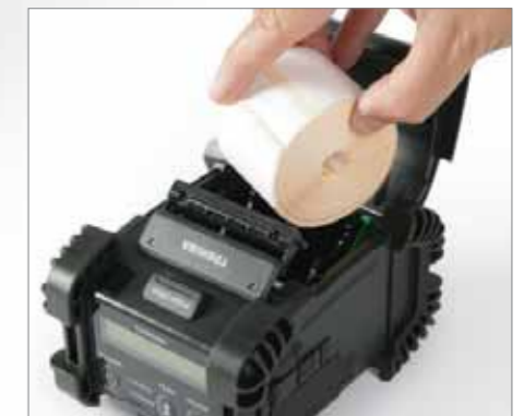
Market-leading media capacity for fewer roll changes