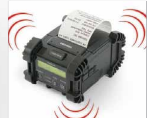
Wi-Fi certified (GH40 model)